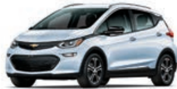
ARCTIC BLUE METALLIC 4 (With Black Grille)