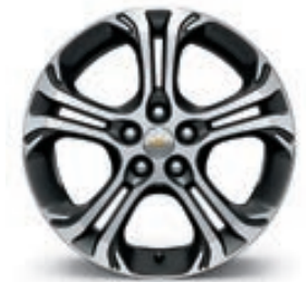
17" Ultra Bright Machined-Aluminum with Painted Pockets (Standard on Premier)