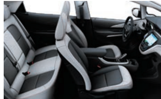
Dark Galvanized Gray/Sky Cool Gray Perforated Leather Appointments 6