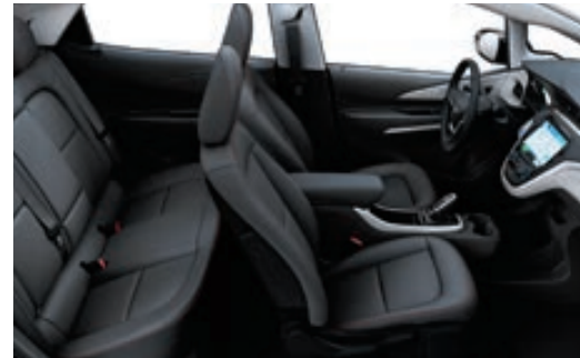
Dark Galvanized Gray Perforated Leather Appointments 6