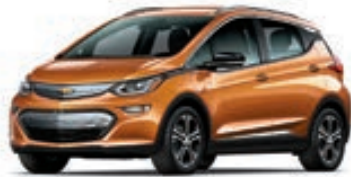
ORANGE BURST METALLIC 3 (With Dark Silver Grille)