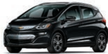
MOSAIC BLACK METALLIC (With Dark Silver Grille)