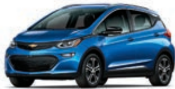
KINETIC BLUE METALLIC 3 (With Black Grille)