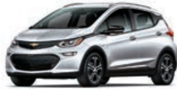
SILVER ICE METALLIC 1,2 (With Black Grille)