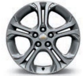
17" Painted-Aluminum (Standard on LT)