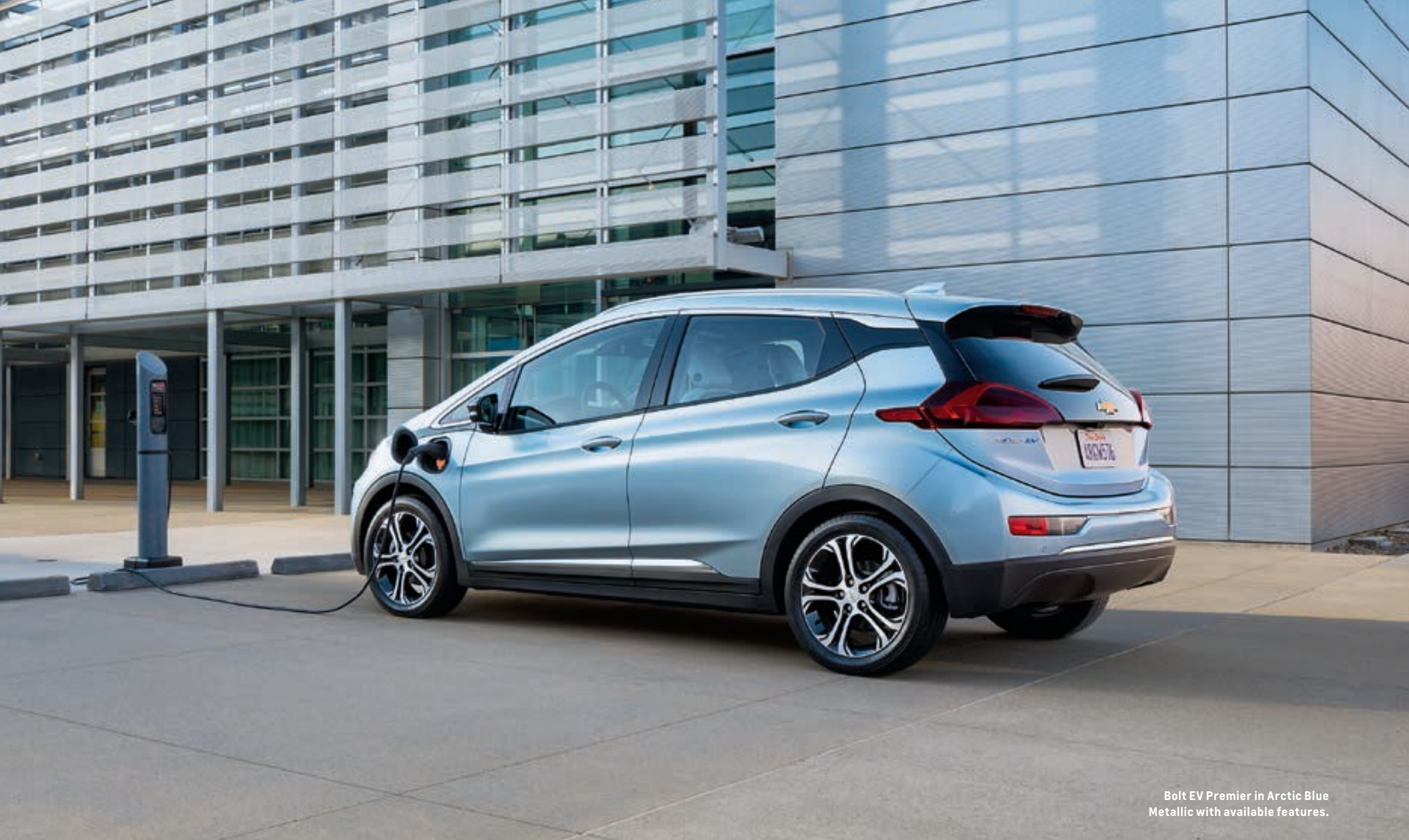
Bolt EV Premier in Arctic Blue Metallic with available features.