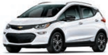
SUMMIT WHITE (With Black Grille)