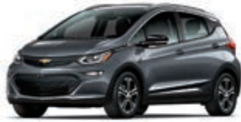
NIGHTFALL GRAY METALLIC (With Black Grille)