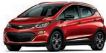
CAJUN RED TINTCOAT 3 (With Black Grille)