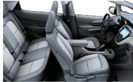
Light Ash Gray/Ceramic White Perforated Leather Appointments 5